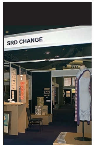
SRD Change08 exhibition at the GreenTech expo

Past Sponsors have included DIA, Adobe, GreenTech, GECA, Sustainable Living Fabrics, Endless Solar, Investa, Unfolding Futures, UTS, UNSW, UWS and USYD